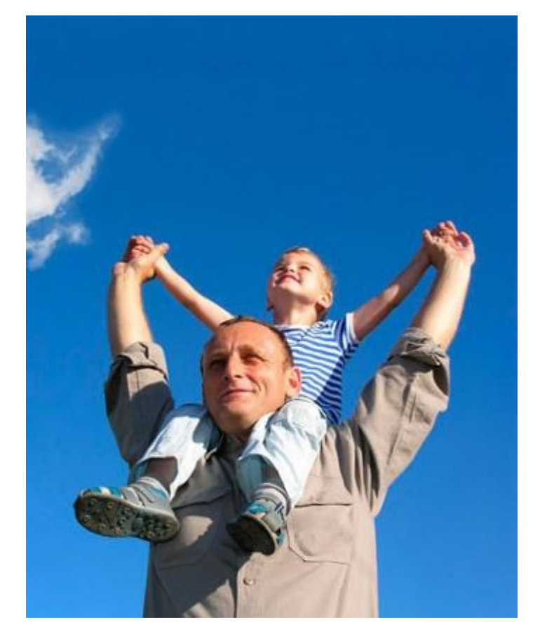
Supporting people with cardiomyopathy and their families.